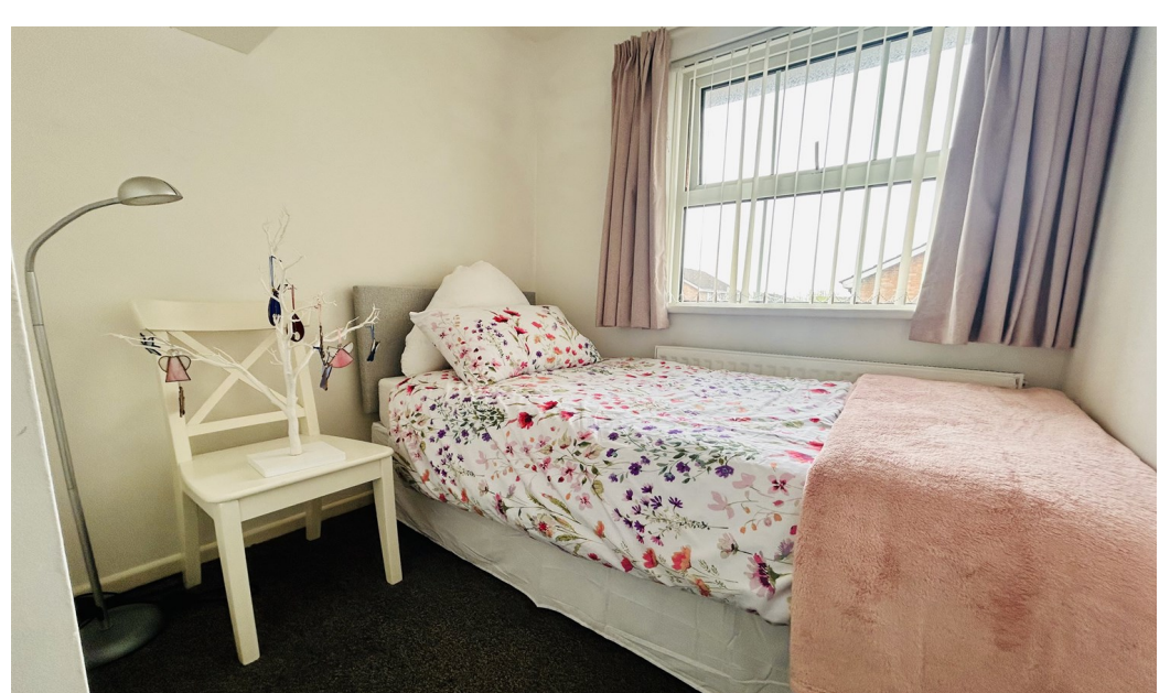
carpet, double glazed