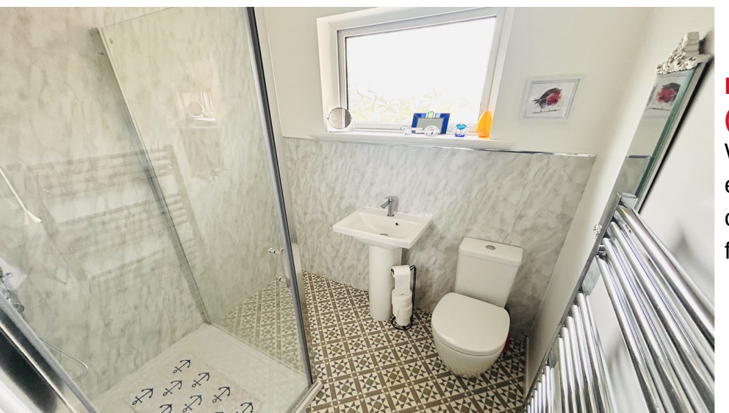
BATHROOM: 1.68m (5'6) x 1.97m (6'6) White three piece, enclosed shower cubicle, hand basin, low flush wc