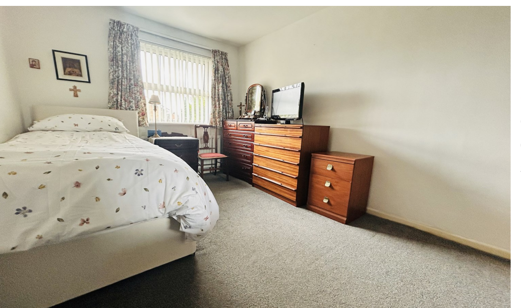
BEDROOM 1: 3.36m (11'0) x 2.7m (8'10) carpet flooring, double glazed and built in storage.